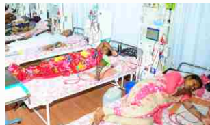
Metropolitan Hospital, Thrissur, Contact No: +91 9746716748