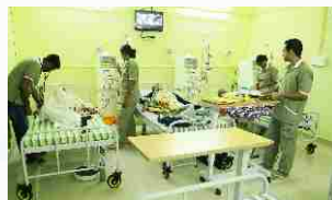
Medical Trust Hospital, Kulanada, Cont: +91 8281469684