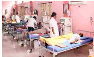
Santhi Dialysis Unit in Kottarappadi, Kalpetta, Wayanad Cont: +91 9497769546