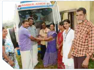
Mobile Lab Handover to Sholayur PHC

among the tribal community, conducting early detection tests of lifestyle diseases, liver and other diseases, including ECG for a nominal sum of 250 INR