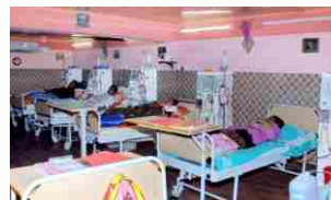
Esaf Hospital, Sultanpet, Palakkad, Cont: +914734260431