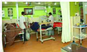
Co-operative Hospital, Kothattukulam Cont: +91 8281643647