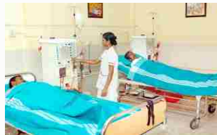
K.M.M Hospital, Puthanpalli Perumbadappa. Cont: +91 9656686545