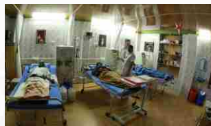
Dhanya Hospital, Chalakudy, Cont: +91 8281260480