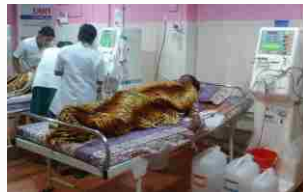
Govt Tribal Specialty Hospital Kottathara, Attappadi. Cont: +91 7559956796