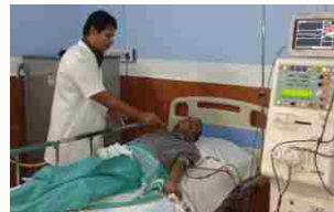
Indira Gandhi Hospital Kavaratti, Lakshadweep, Cont: +91 9895751523