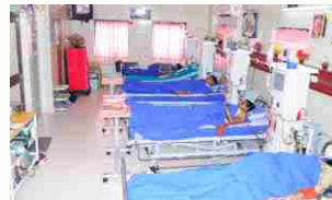
Royal Hospital, Kunnamkulam, Cont: +91 8547456796